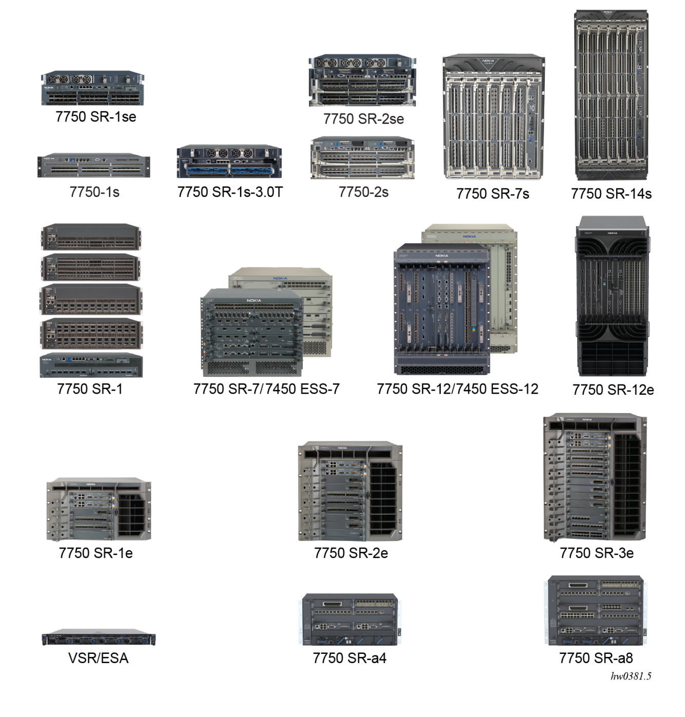
Figure 2: 7750 Service Router (SR), 7450 Ethernet Service Switch (ESS), and VSR