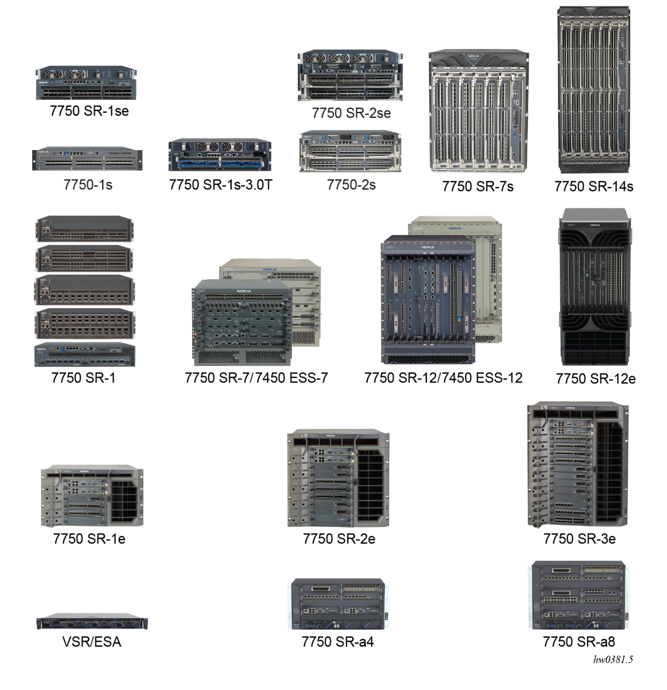
Figure 2: 7750 Service Router (SR), 7450 Ethernet Service Switch (ESS), and VSR