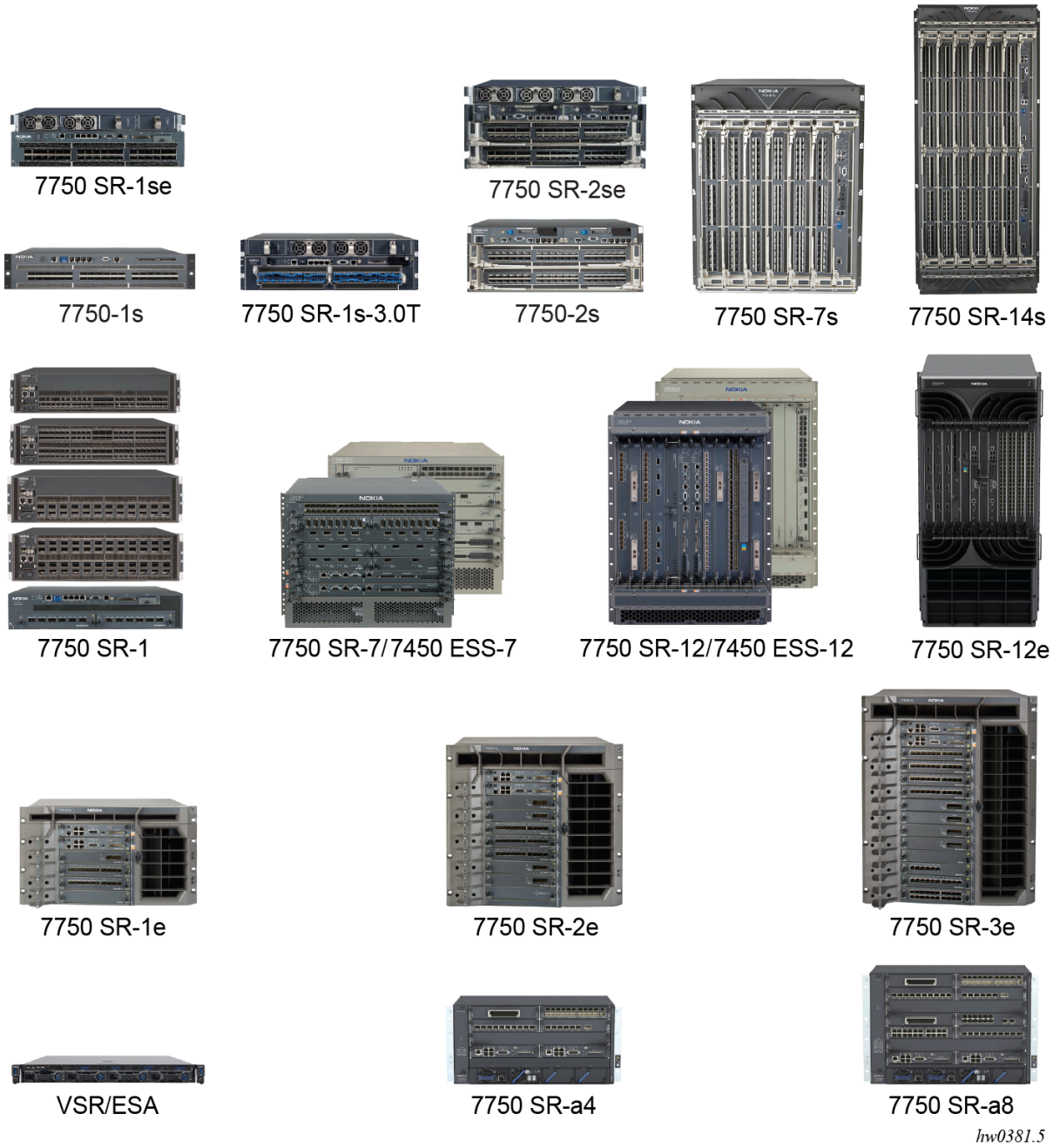
Figure 2: 7750 Service Router (SR), 7450 Ethernet Service Switch (ESS), and VSR